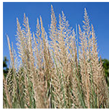
Prairie Grass: Making Every Raindrop Count