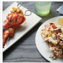
Lobster With More Than Just Melted Butter