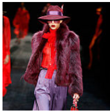
Fall Fashion: The '70s Take the Runway