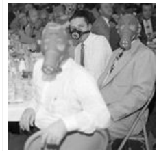
Room for Debate: Life Without the E.P.A.?

Home | World | U.S. | N.Y. / Region | Business | Technology | Science | Health | Sports | Opinion | Arts | Style | Travel | Jobs | Real Estate | Autos | Site Map | © 2011 The New York Times Company | Privacy | Your Ad Choices | Terms of Service | Terms of Sale | Corrections | RSS | Help | Contact Us | Work for Us | Advertise